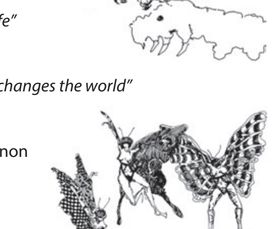
Randolph T. Hester (2006) "Design for Ecological Democracy", p112